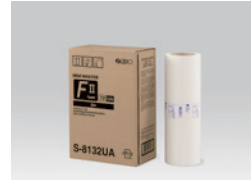
RISO MASTER FII Type (B4: 250 sheets)