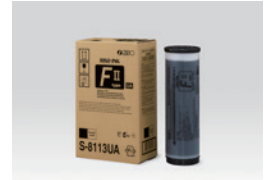
RISO INK FII Type Black (1000 ml)