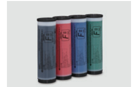
RISO INK FII Type Color (1000 ml)

The RISO iQuality mark indicates a RISO product compatible with the RISO iQuality System.