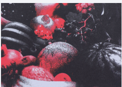
Printed by previous models