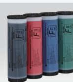
RISO INK FIL TYPE Color (1000 ml)

The RISO i Quality mark indicates a RISO product compatible with the RISO i Quality System.