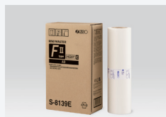
RISO MASTER FIL TYPE HG97 RISO MASTER FIL TYPE HD87 (A3: 220 sheets)