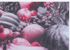
Printed by the RISO MH series