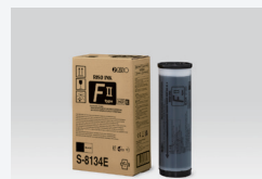
RISO INK FIL TYPE HD BLACK (1000 ml)